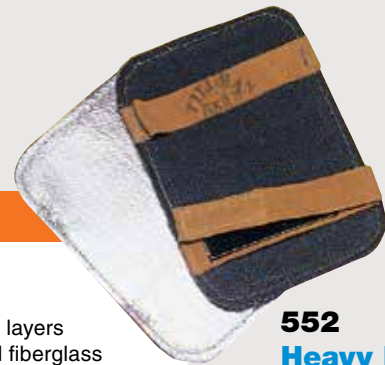
552 Heavy Duty Protection