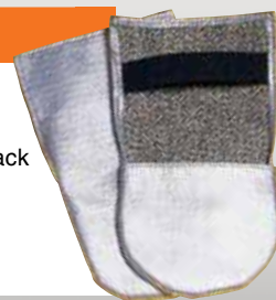
555 Standard Protection Single Layer