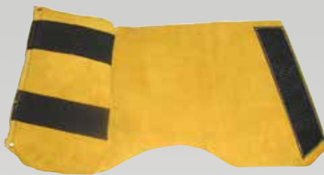
Arm Pad opened