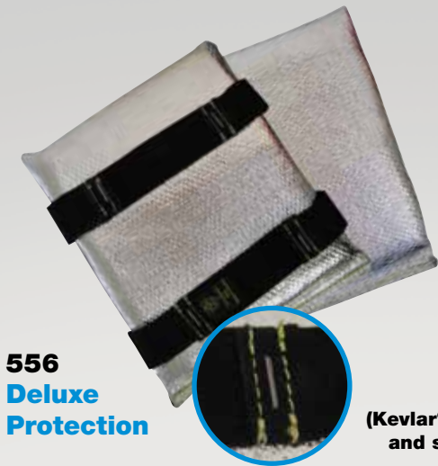
556 Deluxe Protection