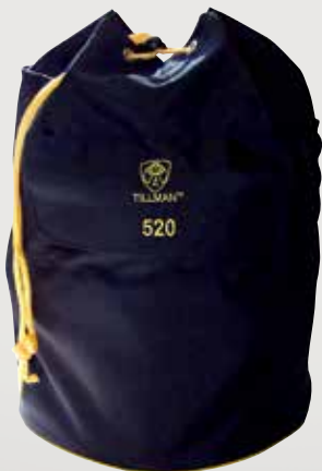
520 Helmet Bag