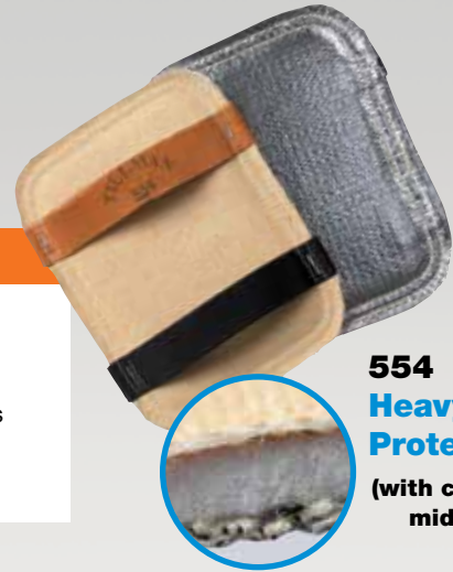
554 Heavy Duty Protection (with ceramic wool middle layer)